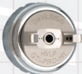
No H1 HVLP Air Cap