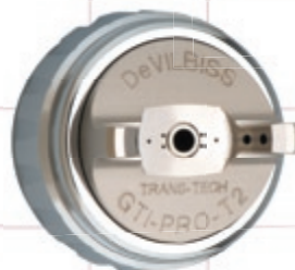
No T2 Trans-Tech Air Cap