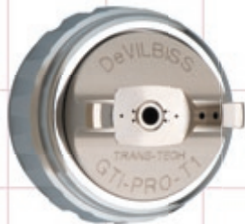
No T1 Trans-Tech Air Cap